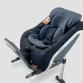
Deep Water Blue